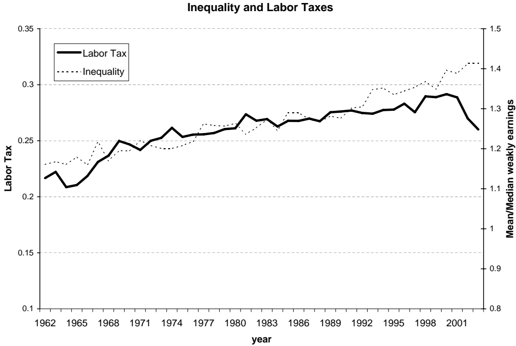
Figure 2: Average labor taxes and ratio mean to median earnings in US(data from Eckstein and Nagypal (2004)).