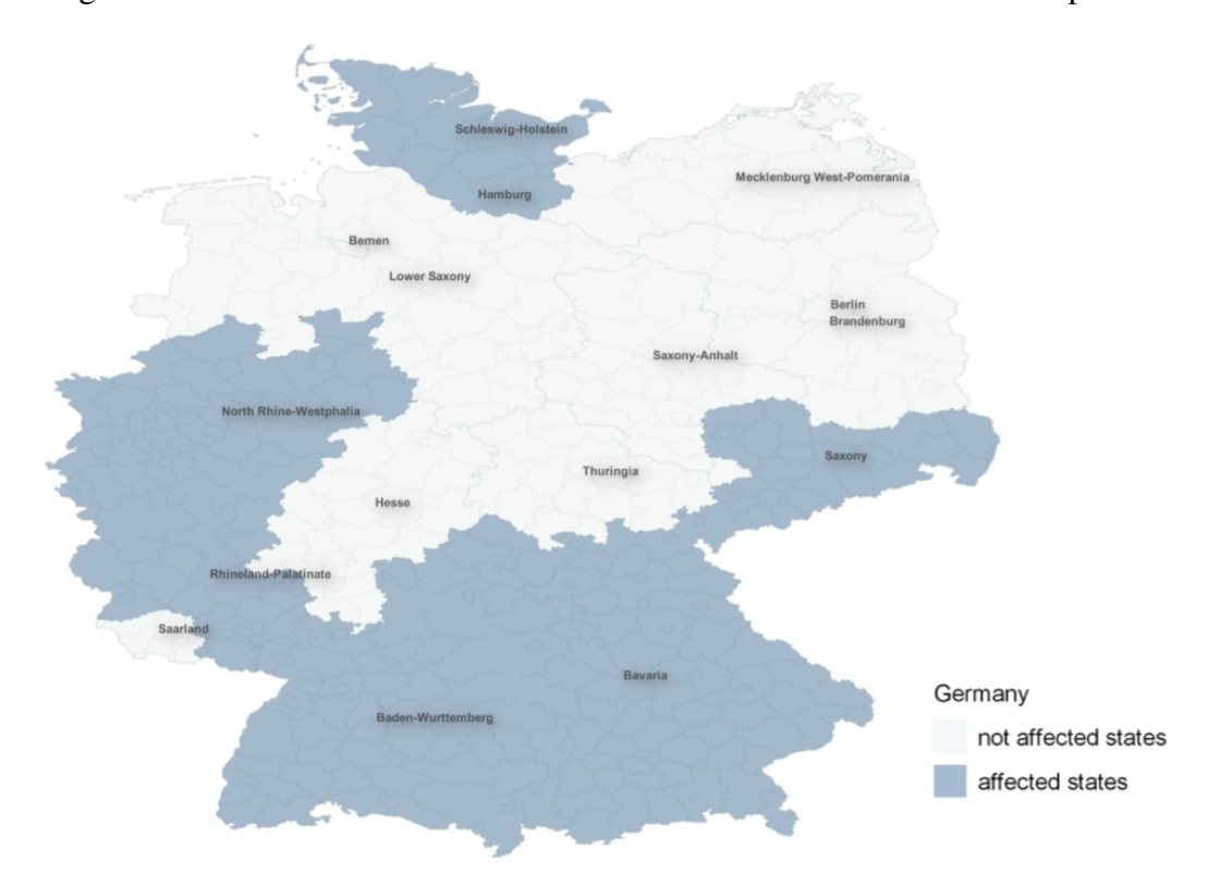
Figure 2: Affected States versus Unaffected States due to Landesbank Exposure