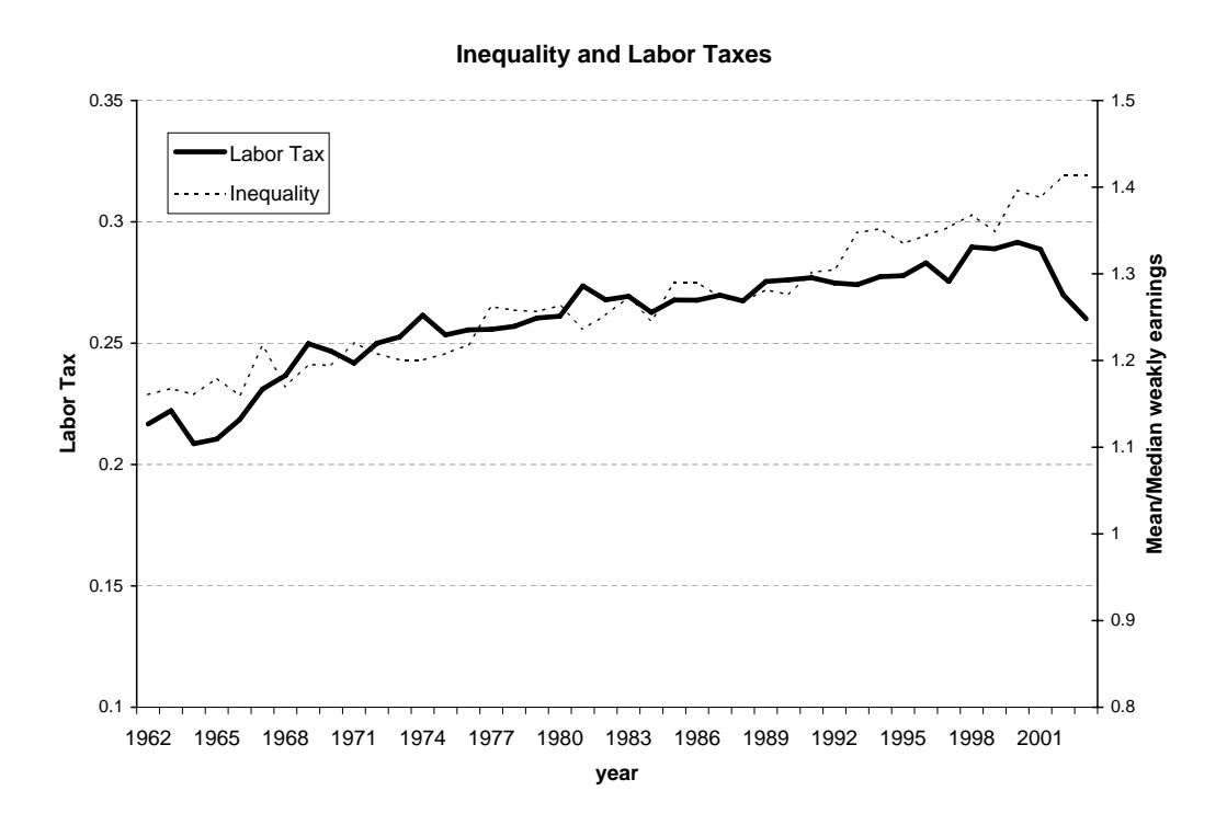
Figure 2: Average labor taxes and ratio mean to median earnings in US(data from Eckstein and Nagypal (2004)).